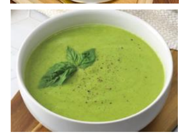
Roasted Zucchini Basil Soup – (Vegan, Dairyfree)