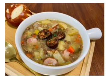
Lentil Sausage Soup following Grandma's recipe