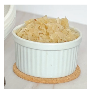
Apple Caraway Sauerkraut 2k $60