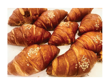
Mini Cretzel lye-baked pretzel croissant $36 for 24 pcs