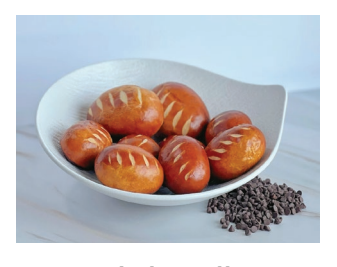
Schoko Roll soft pretzel rolls filled with Belgian chocolate