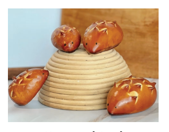
Karamel Igels hedgehog buns filled with salted caramel