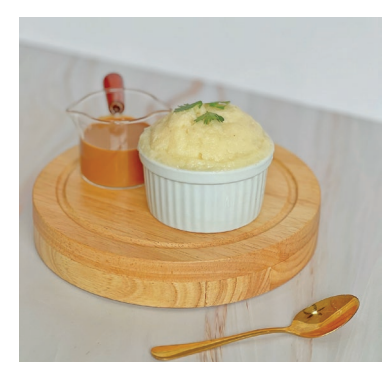
Mash Potatoes and Gravy 2kg $45