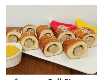
Sausage Roll Bites Nürnberger pork sausage wrapped with pretzel bun