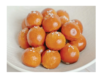
Salt Pretzel Poppers $20 for 24 pcs